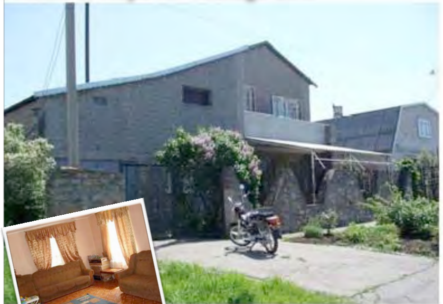
Ruth's House - Berdyansk, Ukraine

After five years of prayer, a dream has become a reality! Girls who graduate from the Berdyansk orphanage will finally have a place to call home.