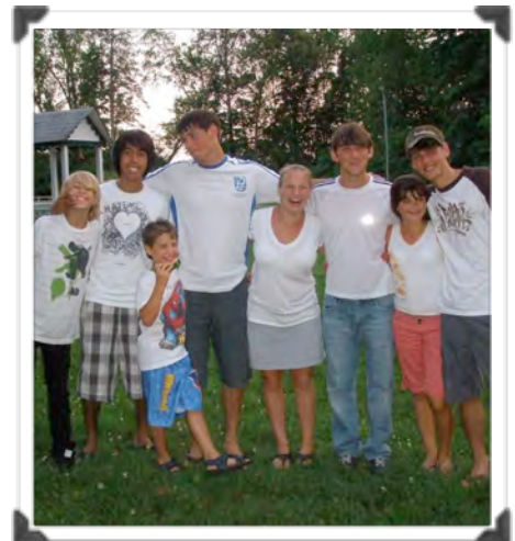
Reconnecting & Making New Friends Berdyansk Reunion '08